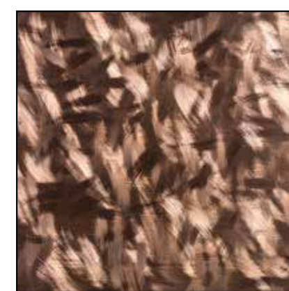
74 Machined Copper