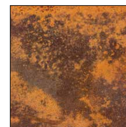
60 Weathered Rust