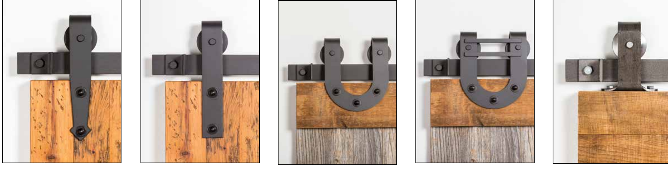
401 Arrowhead 402 Straight 403 Horseshoe 403 DBHH Double Bar Horseshoe 407 Top Mount