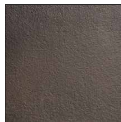
80 Painted Bronze