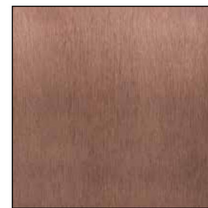
01 New Penny