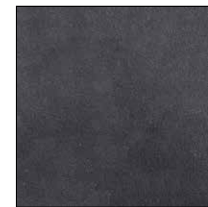
00 Flat Black