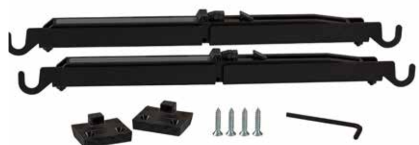
Close Ease Pack (0119-0092)

Soft-closing mechanism to close doors silently and smoothly. The mechanism, concealed behind the track, catches the activator for gentle, even closing. Door weight capacity of 150 lbs. (Pictured from rear view)