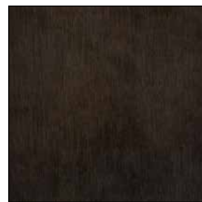
05 Antique Bronze