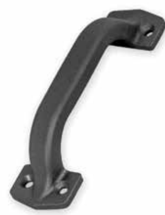
Cast Iron Raised Bow Handle (0117-0054)

Sliding door locking system with safety opening feature. Jamb mounted.