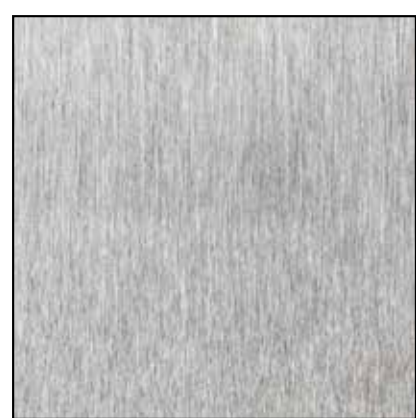
90 Brushed Nickel Finish