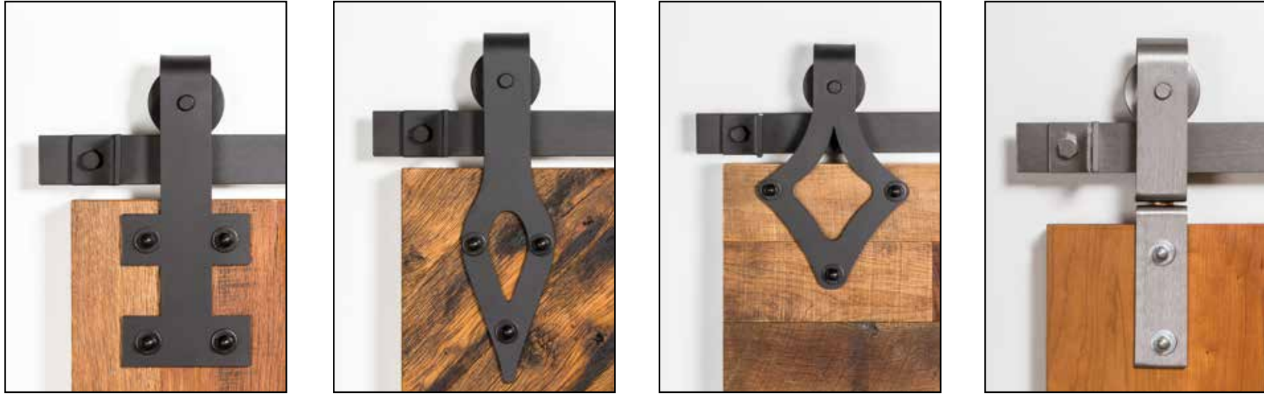
409 I-Shape 410 Teardrop 411 Wide Teardrop 413 Swivel