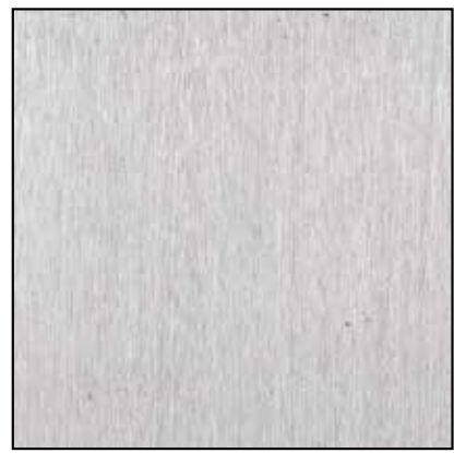
50 Brushed Stainless Steel