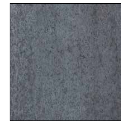
27 Clear Coated