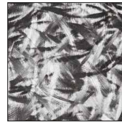
30 Machine Polished