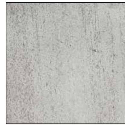
40 Mill Finish Stainless Steel