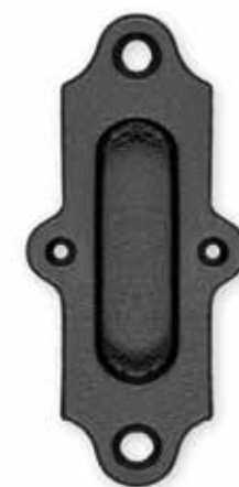
Cast Iron Flush Pull Handle (0117-0099)